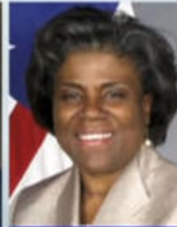
LINDA THOMAS- GREENFIELD